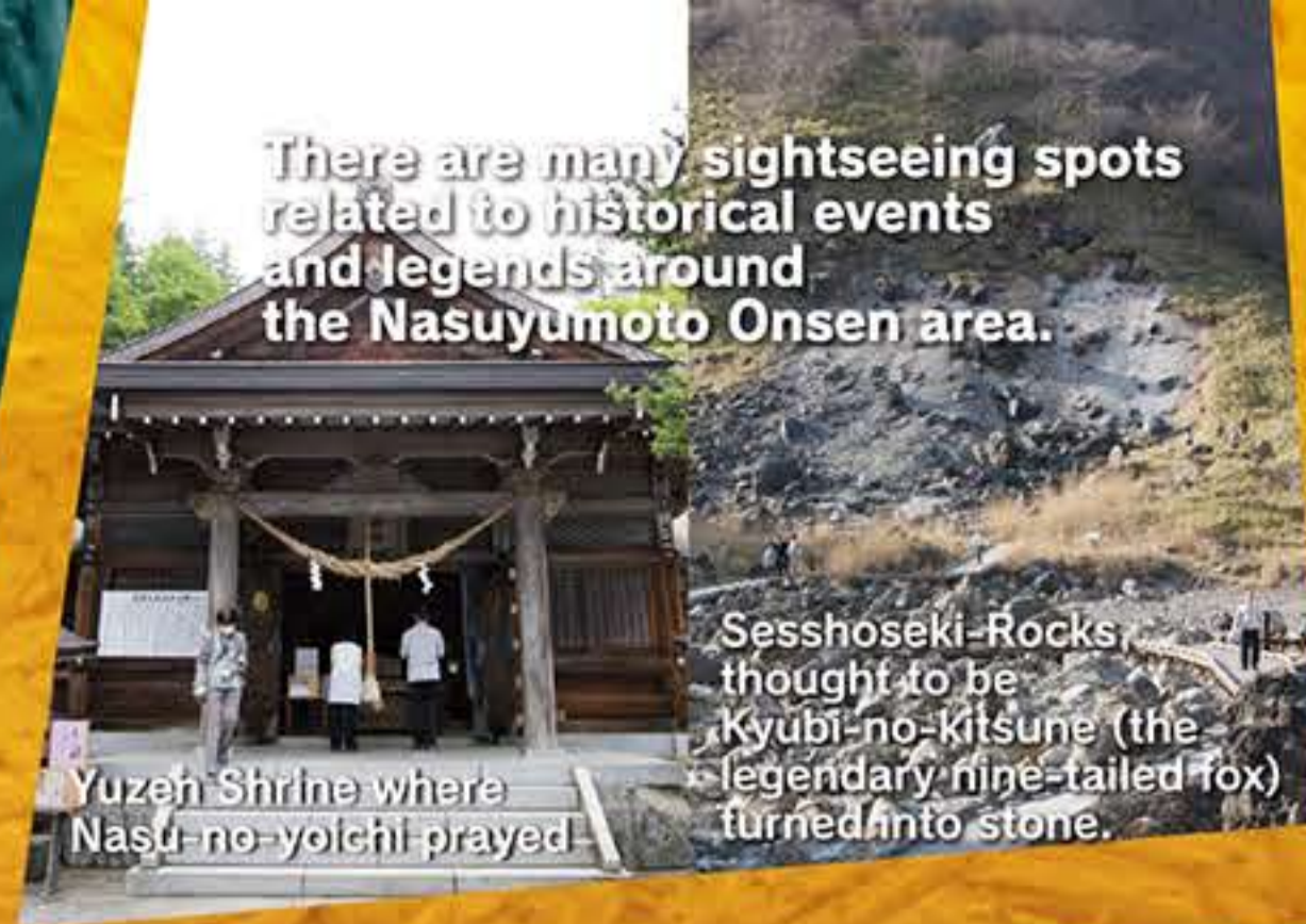
Yuzen Shrine where Nasu-no-yolchi prayed

There are many sightseeing spots related to historical events and legends around the Nasuyumoto Onsen area.