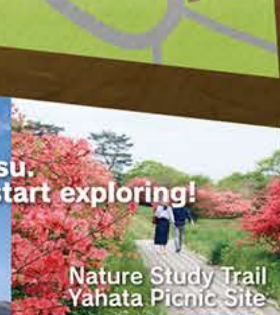
Nature Study Trail Yahata Picnic Site

Any climber, from beginner to expert, can enjoy Mt. Chausudake.