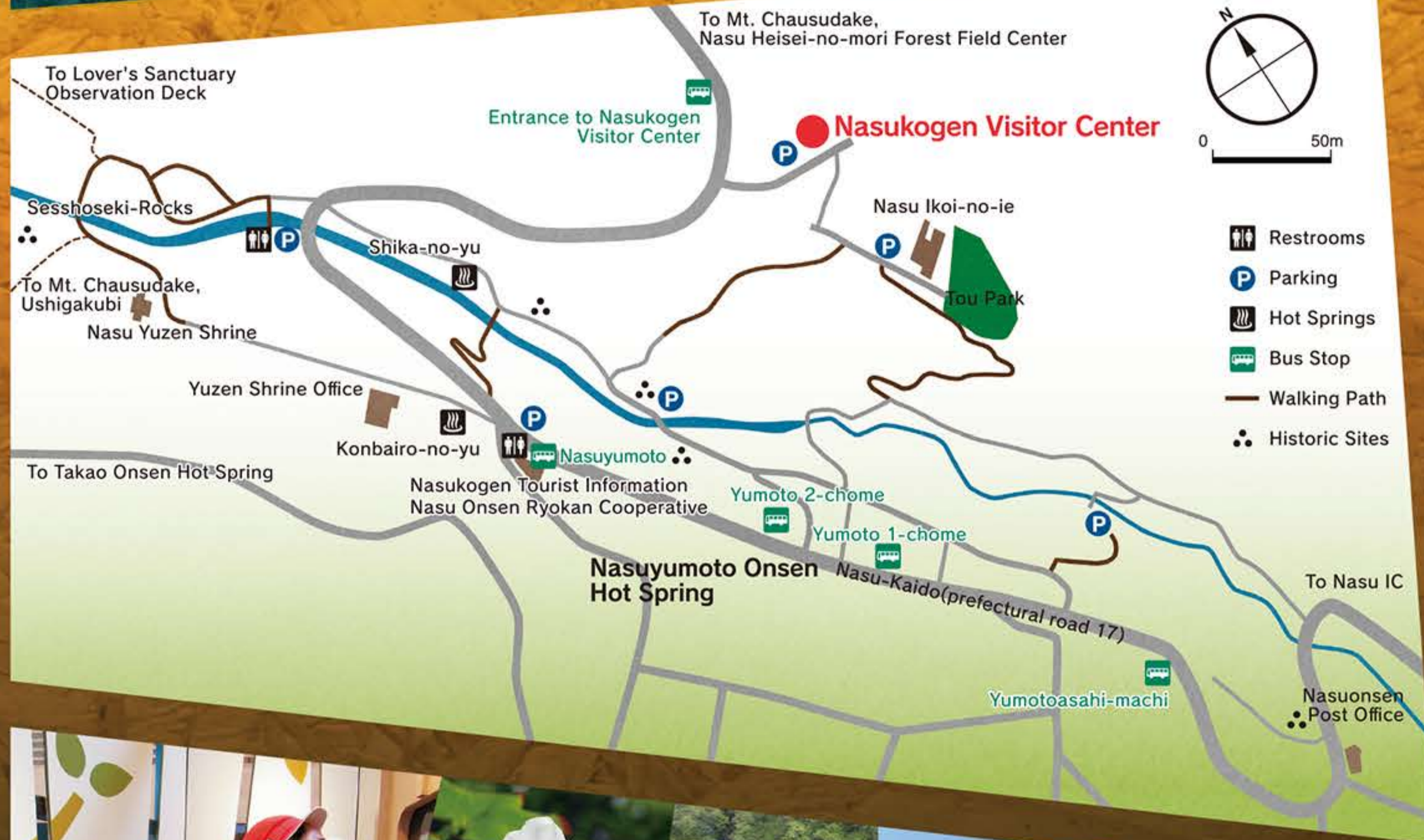
Sesshoseki-Rocks, thought to be Kyubi-no-kitsune (the legendary nine-tailed fox) turned into stone.